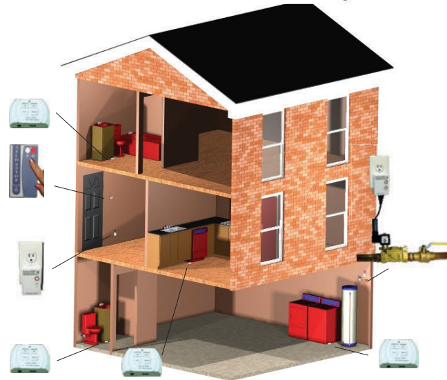
Multi Level Homes